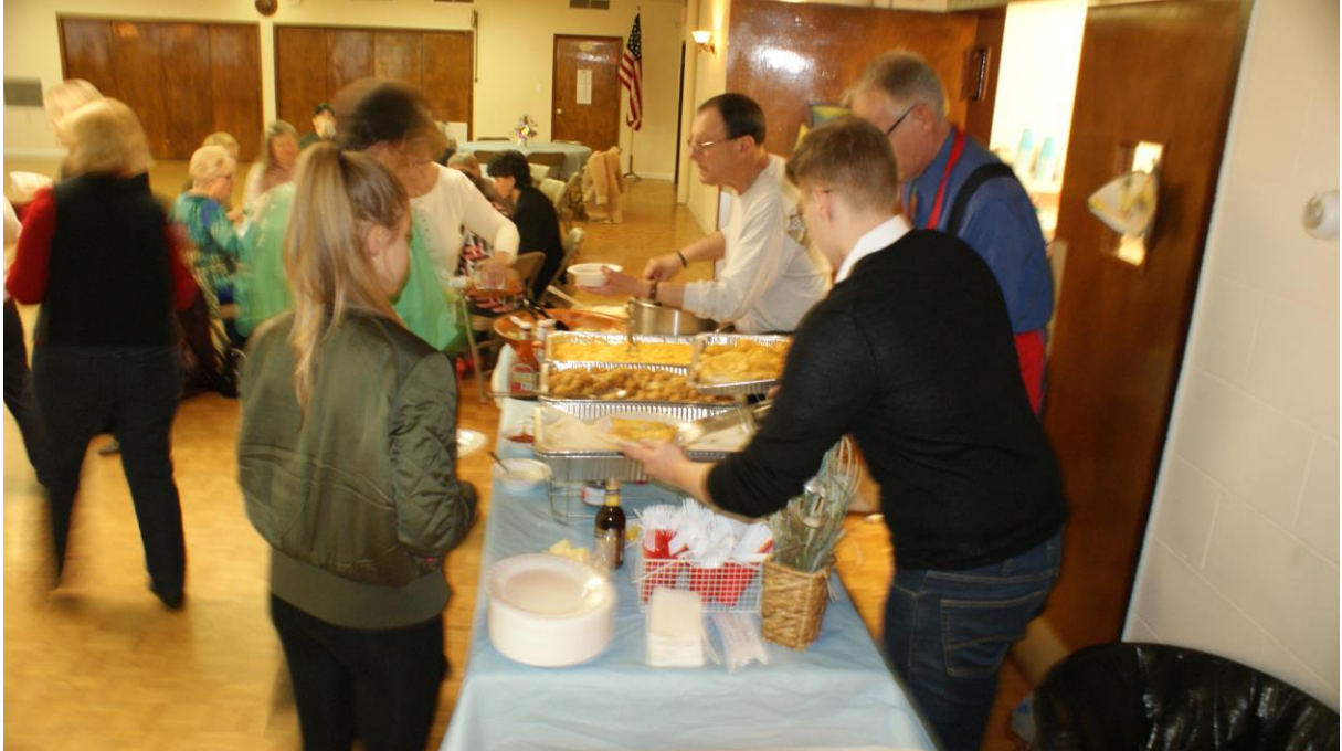
Fish and Chips – Sunday March 26, 2017

11:00 AM – Holy Mass for all Parishioners