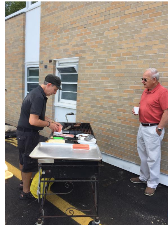
Parish Picnic – June 11, 2017