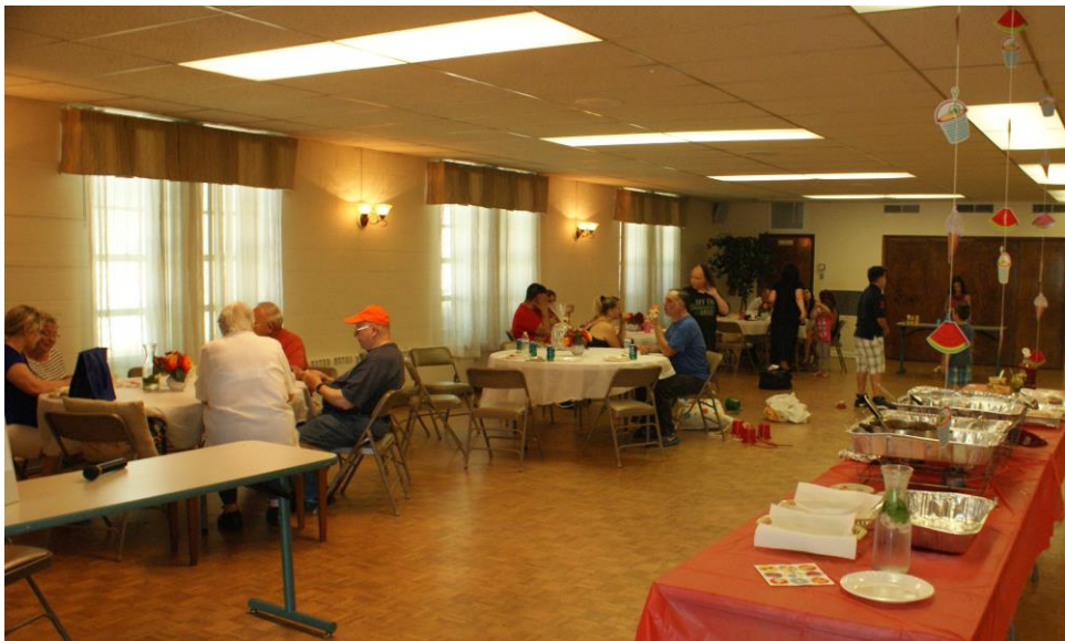
Parish Picnic – June 11, 2017