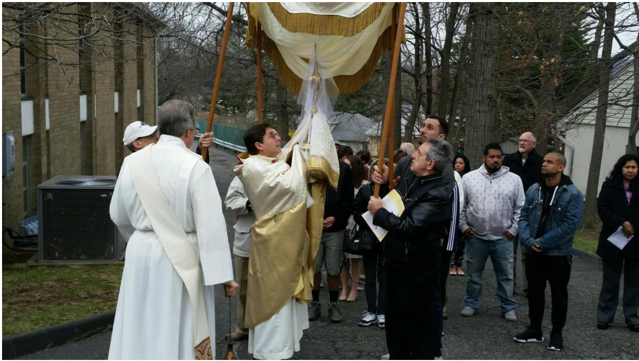
EASTER PROCESSION around the church on Sunday March 27, 2016