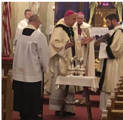
Mass of Chrism, Scranton, PA

EASTER FLOWERS – An Easter Flower Fund Envelope is included in the Sunday Collection envelopes and will be available in the parish vestibule. Thank you for beautifying our church. Committee