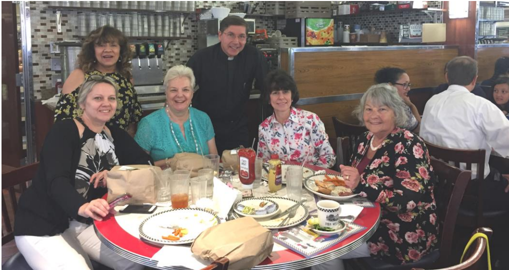
Adoration Society Annual Luncheon on June 2, 2019 at Park West Diner