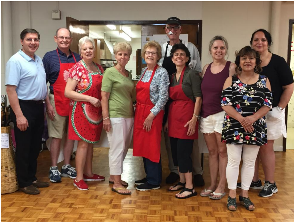
Flea Market – June 8, 2019 – Some of our crew that organized this event