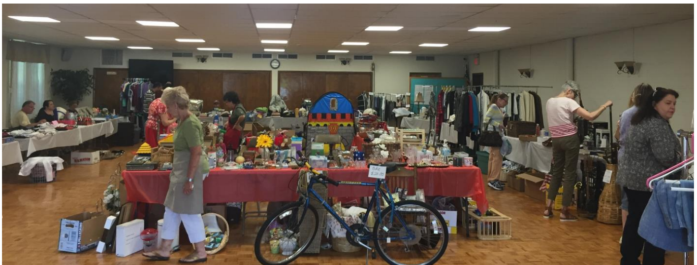
Flea Market – June 8, 2019 – parish hall with outside vendors