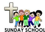
SUNDAY SCHOOL Mass

11:00 AM – Holy Mass for All Parishioners Living and Deceased