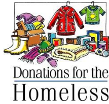
Donations for the Homeless