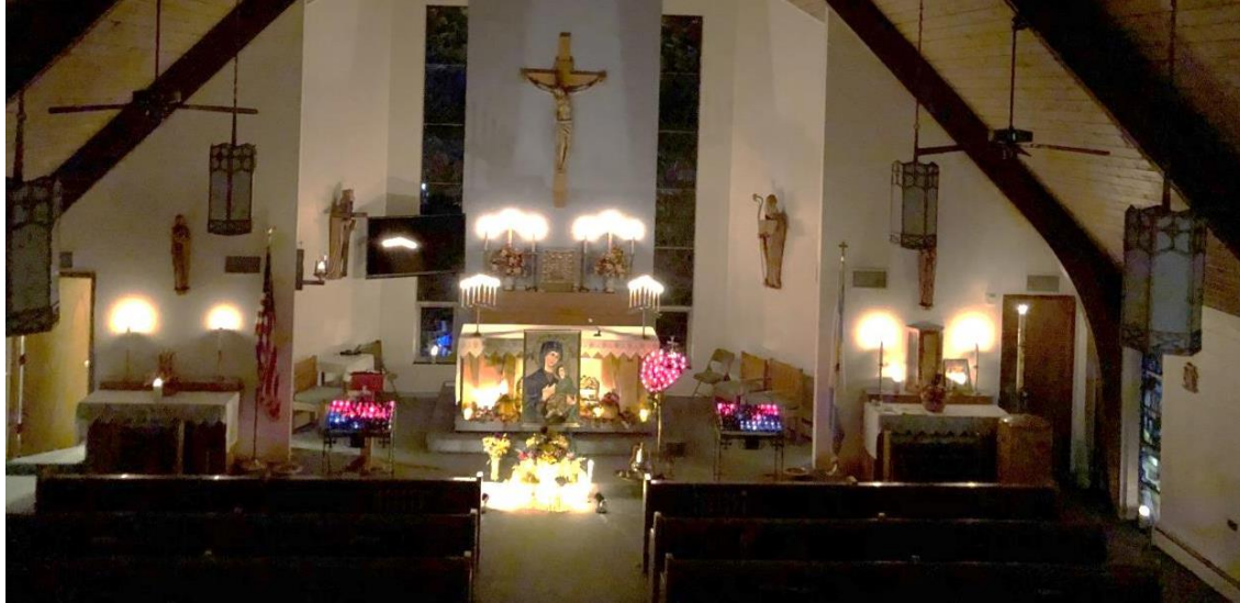
Candlelight Prayer Service With Beautiful Music

Holy Cross Parish PNCC - 220 Browertown Rd, Woodland Park, NJ