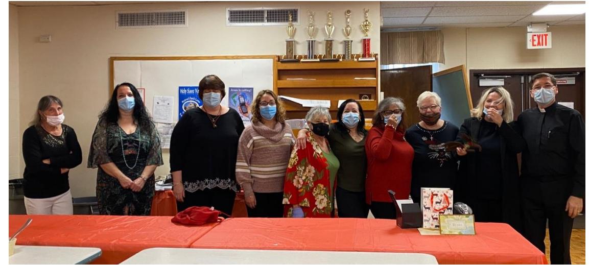
Christmas Dinner Dec. 13, 2020

We thank Parish Committee and Adoration Society for all efforts to organize our annual Christmas Luncheon on Sunday Dec. 13, 2020. We thank those who attended the event and made it a joyful day especially for the children who were part of our celebration.