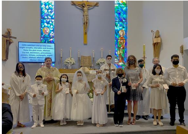
of consecration which Jesus used during the Last Supper: This is My Body... This is My Blood... (Catechism of the PNCC)

The new recipients of the Holy Eucharist are welcomed to participate in the life of the parish by being altar servers, lectors reading the Word of God, and being part of various parish committees.