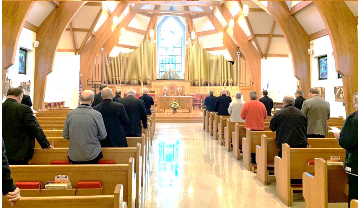
National Clergy Conference – October 25-27, 2021 Lancaster, NY at Cathedral of Holy Mother of the Rosary