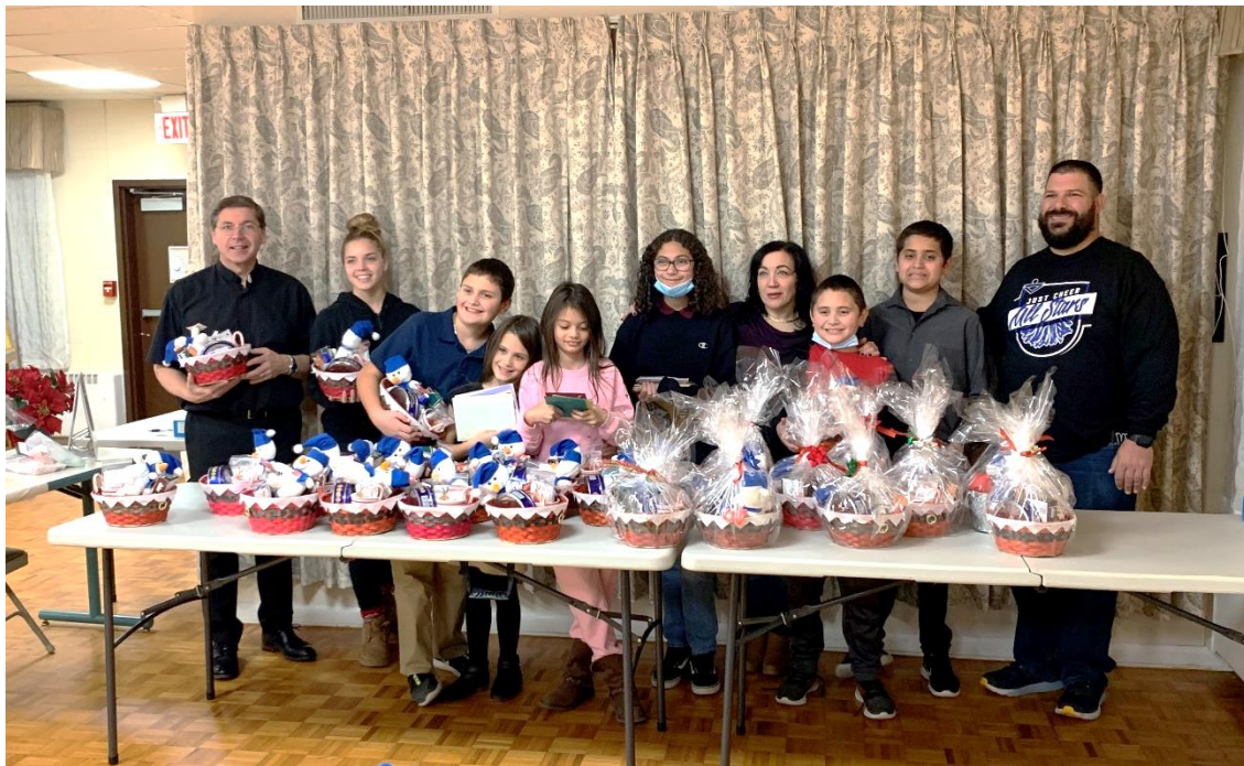
Sunday School preparing gifts for seniors living in Paterson.