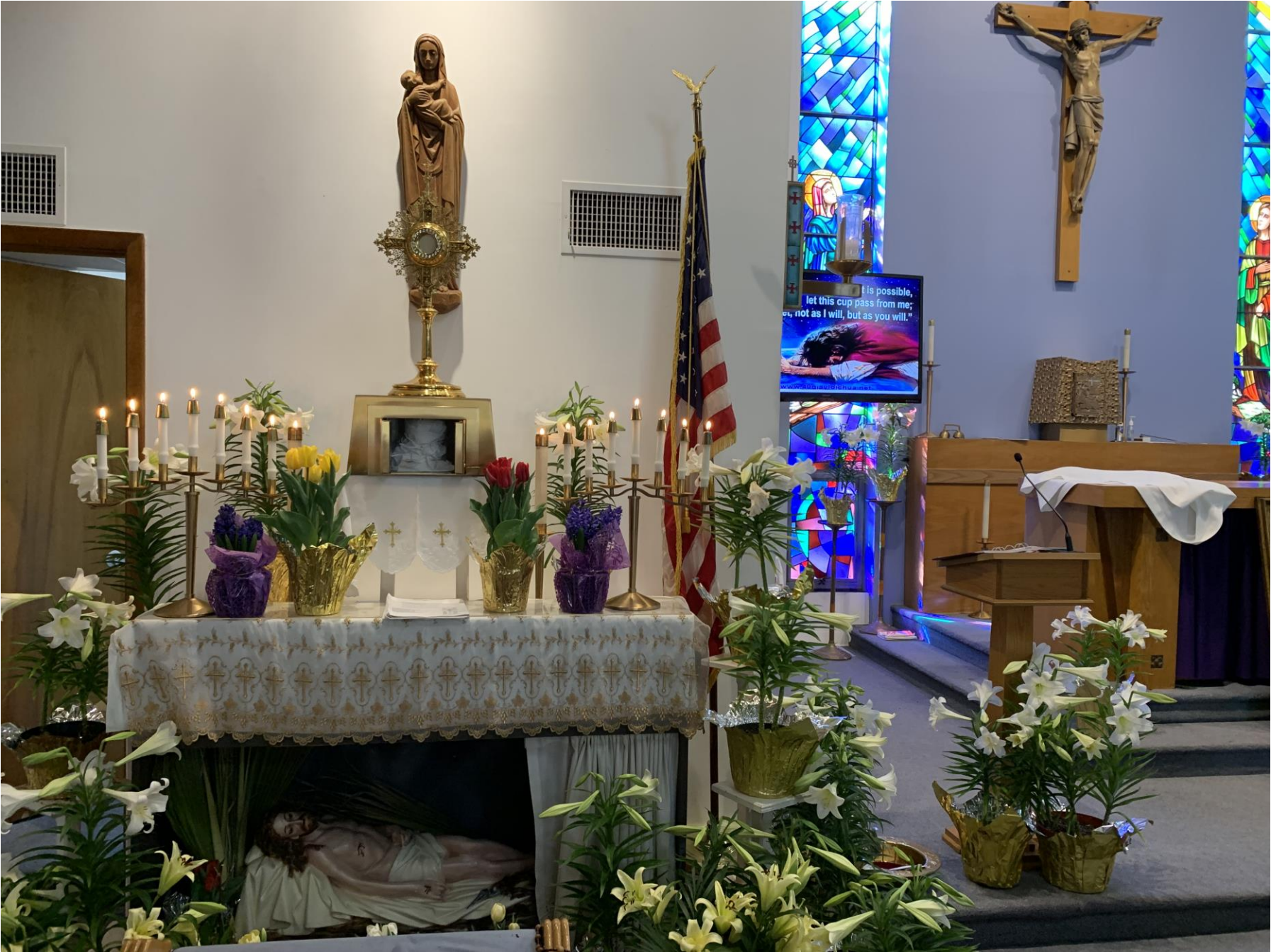
Church Sanctuary decorated for Holy Thursday: