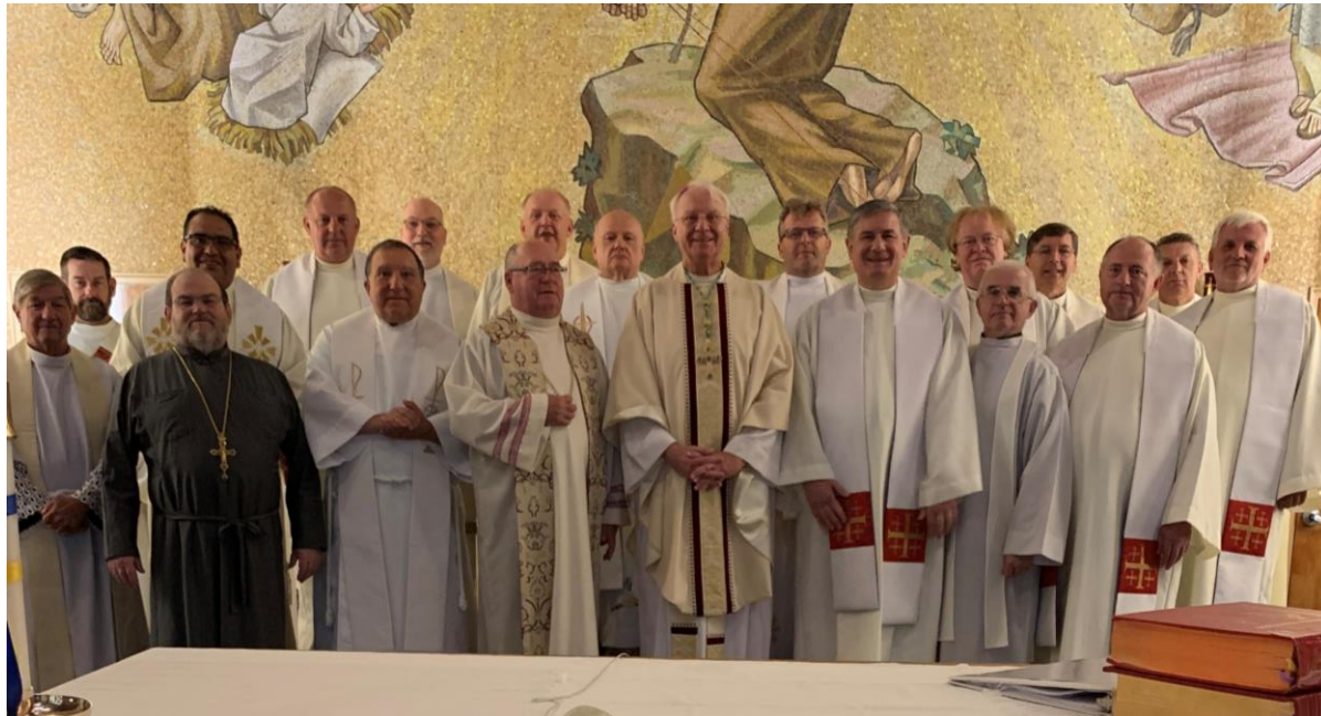
Central Diocese Clergy Retreat and Conference St. Francis Retreat Center, Easton, PA - Aug. 21-23, 2023