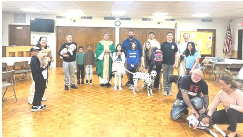
Blessing of Pets Oct. 1, 2023