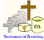
Sacrament of Anointing

HOSPITAL VISIT. “Is anyone among you sick? He should summon the presbyters of the church, and they should pray over him and anoint him with oil in the name of the Lord...” (James 5:14). If you or a member of your family are ill and would like to receive the Holy Communion at home or at the hospital, please notify the rectory